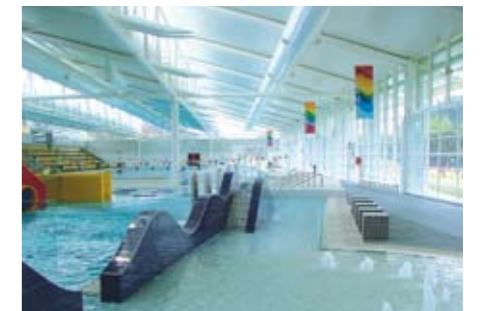
PENINSULA LEISURE – POOL HALL