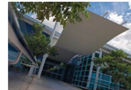
PENINSULA LEISURE CENTRE

“ OUR INHOUSE QA SYSTEM FULLY CONTROLS THE PASSAGE OF ALL PROJECTS THROUGH OUR OFFICE...”