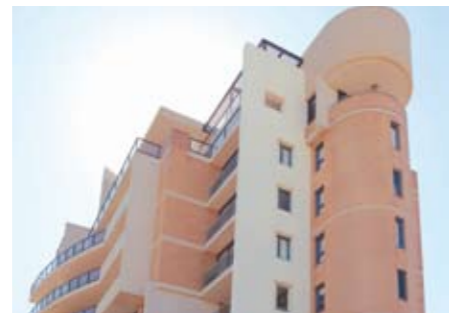
THE PALISADES, BONDI JUNCTION

Our completed projects are renowned for quality design, functionality, sustainability and excellence. We will aim to work within your budget and timeframe and we will ensure that you are kept informed of how the project is progressing at every stage.