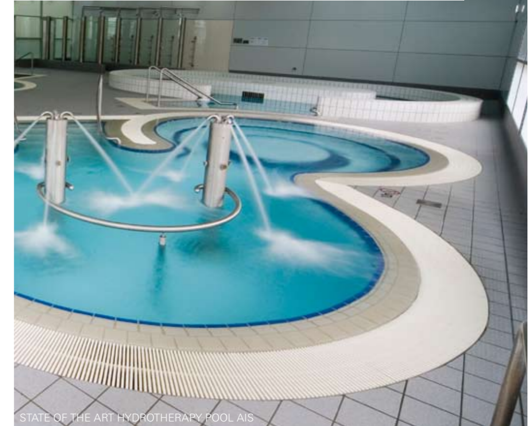
STATE OF THE ART HYDROTHERAPY POOL AIS