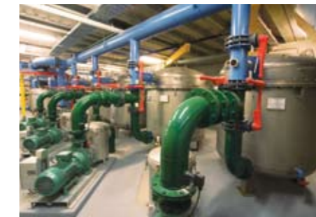
FILTRATION EQUIPMENT AIS