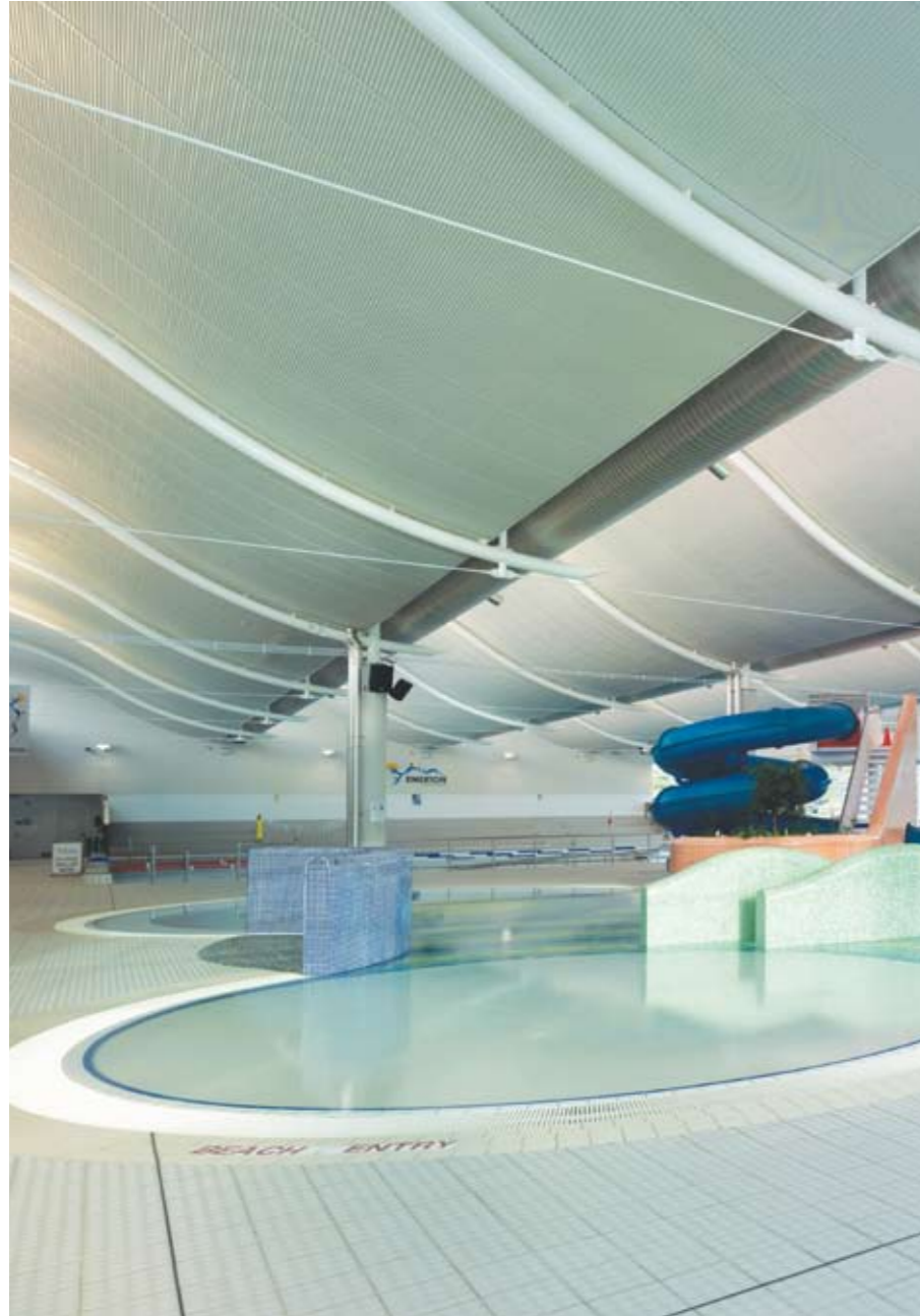
LEISURE POOL – EMERTON