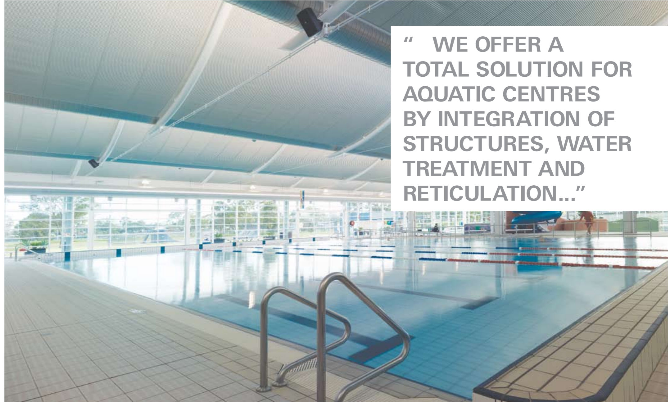
POOL HALL – EMERTON

“ WE OFFER A TOTAL SOLUTION FOR AQUATIC CENTRES BY INTEGRATION OF STRUCTURES, WATER TREATMENT AND RETICULATION...”